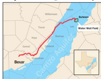
Map of Vista Ridge Water Project

Since being selected as co-financial advisor for SAWS, Estrada Hinojosa has assisted them in 66 transactions totaling over $7.6 billion ranging from new money issues to complex refundings such as the takeout of the District Special Project debt and assisting with the Vista Ridge project. Estrada Hinojosa recently helped SAWS develop a 142-mile, 50,000 acre-foot pipeline project to create a new source of water for the San Antonio area. Unique among large American cities, San Antonio relies largely on groundwater to meet its water needs, mainly from the Edwards Aquifer watershed, a prolific artesian aquifer located in Central and South Texas. As Texas’s recent drought and increasing population demands (20,000 new residents are added to the San Antonio Metropolitan area each year) force more stress on existing water sources, SAWS began to look elsewhere for long-term and sustainable sources of water.